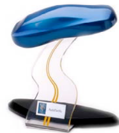
The 2006 AutoPacific Vehicle Satisfaction Award

The winners of the 2006 AutoPacific Vehicle Satisfaction Awards are listed on the following pages using AutoPacific segmentation.